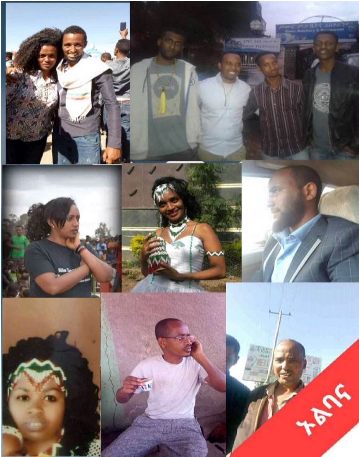
Although the numbers of those released are high, with many well-known leaders among them; there are still many more who are waiting to embrace their loved ones. Sadly, there are also those who will never be reunited because either their loved one died in prison or disappeared without any word from them since.